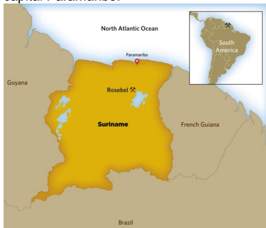
Figure 1: Map of Suriname with Rosebel Gold Mines

Rosebel Gold Mines N.V. is located near the town of Brownsweg in the district Brokopondo, south of the capital Paramaribo.